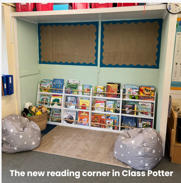
The new reading corner in Class Potter